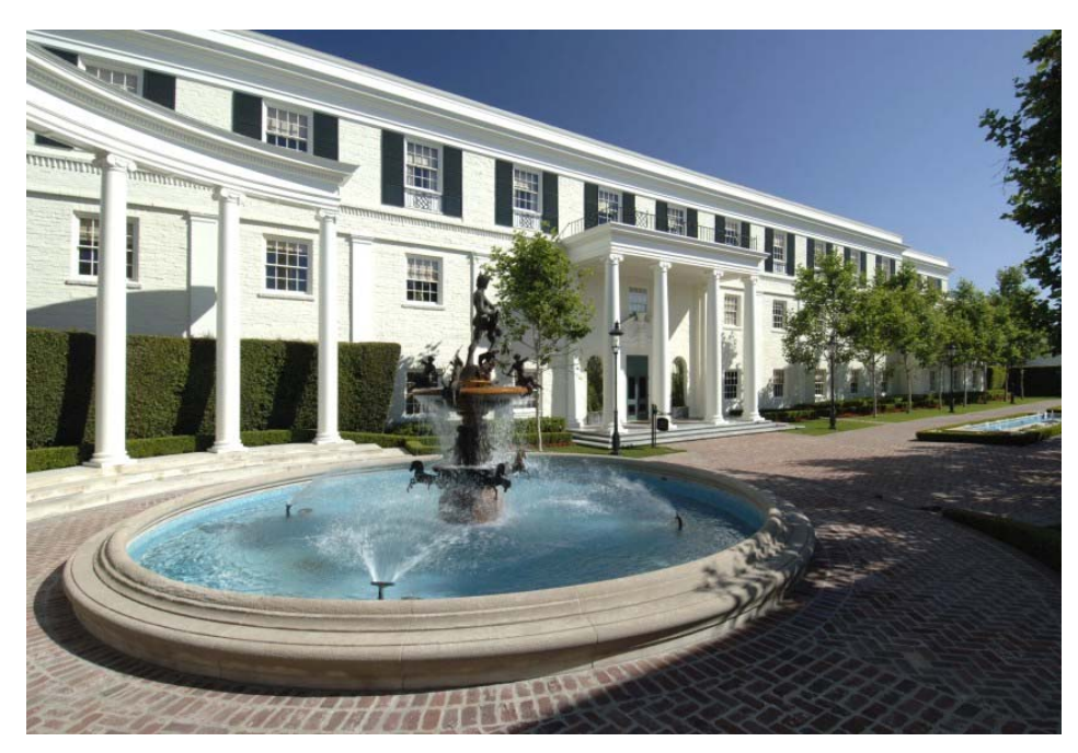
Platinum Equity headquarters in Beverly Hills.

for 15 minutes. Sometimes family members ran up $200 monthly bills from Securus.