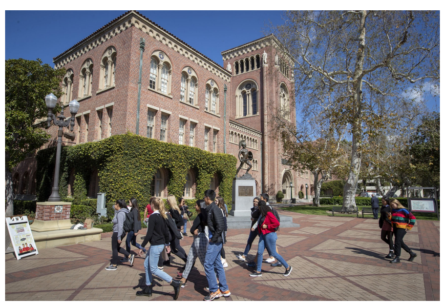
Students walk past a statue of the school mascot, Tommy Trojan, on campus at the University of Southern California in Los Angeles.

At the same time, USC's popularity and success have exacted a steep price. Parents are joking its initials stand for